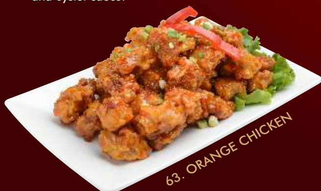
63. ORANGE CHICKEN

Thai style sautéed shrimp with fresh cut asparagus in garlic, white wine and oyster sauce.