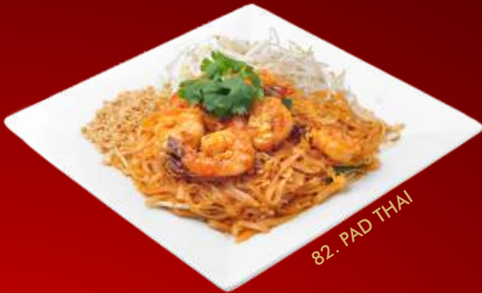
82. PAD THAI