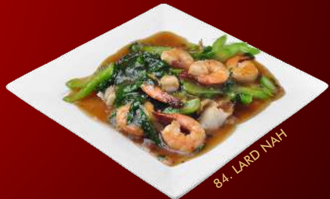
84. LARD NAH

Choice of chicken or pork pan-fried with mixed vegetables, glass noodles (woon sen) and eggs.