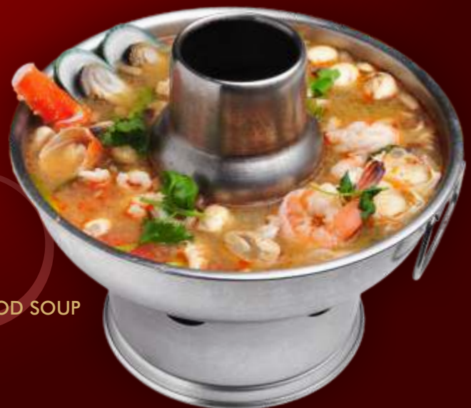
36. SPICY SEAFOOD SOUP