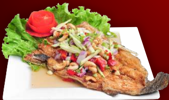
27. TROUT WITH GREEN APPLE SAUCE

Deep-fried whole trout served with green apple sauce mixed with chili, cilantro, onions, and cashew nuts.