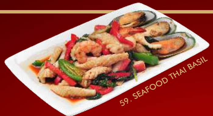
59. SEAFOOD THAI BASIL

Beef and broccoli stir-fried with carrots and oyster sauce.