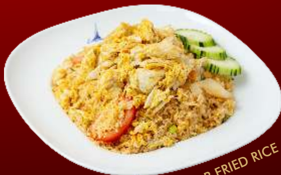
49. CRAB FRIED RICE