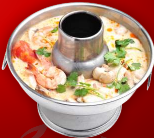
34. SHRIMP TOM KAH

Shrimp, squid, fish, crab legs, and green mussels with mushrooms, lemongrass, tomatoes, lime juice, basil, green onions, and chili oil.