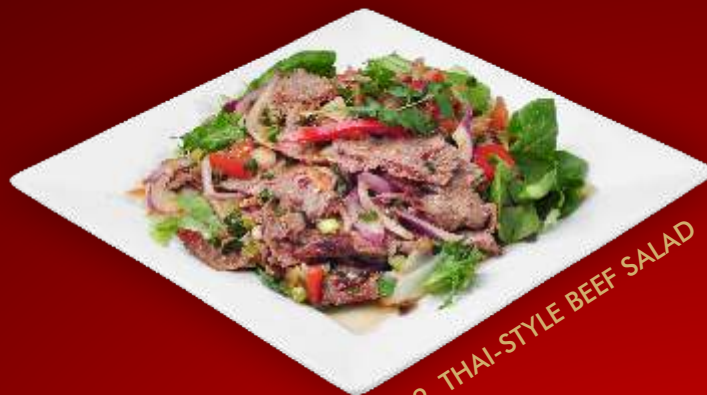
19. THAI-STYLE BEEF SALAD

Spicy grilled beef with chopped onions, lettuce, tomatoes and ground roasted rice in spicy lime juice.