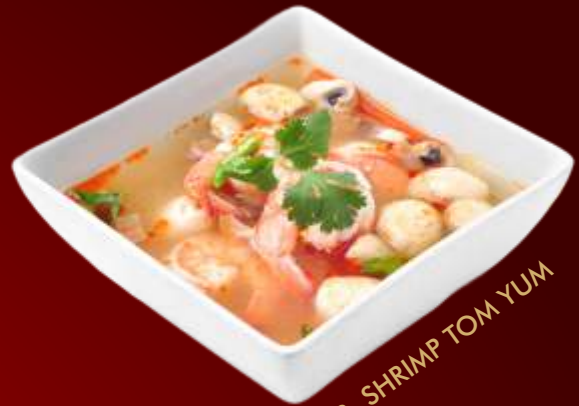
32. SHRIMP TOM YUM

Famous Thai hot and sour soup with chicken, mushrooms, tomatoes, lemongrass, galangal, and chili oil.