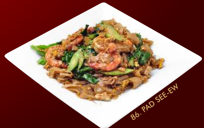
86. PAD SEE-EW