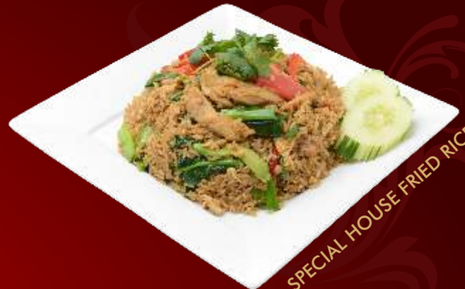
43. SPECIAL HOUSE FRIED RICE

Fried rice with shrimp, chicken, pineapple chunk, cashew nuts and raisins.